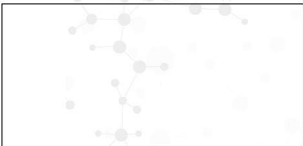
Mandibular occlusal view